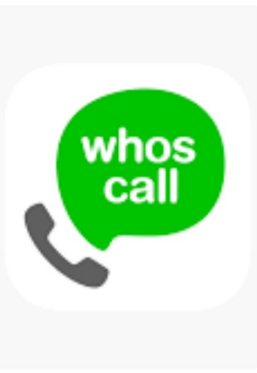
Bukit Aman collaborates with Whoscall to curb online cheating