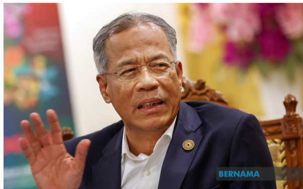
DBKL launches e-Assessment and Property System