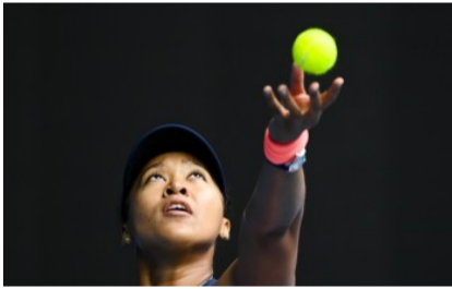
4-time Grand Slam champion Naomi Osaka announces pregnancy