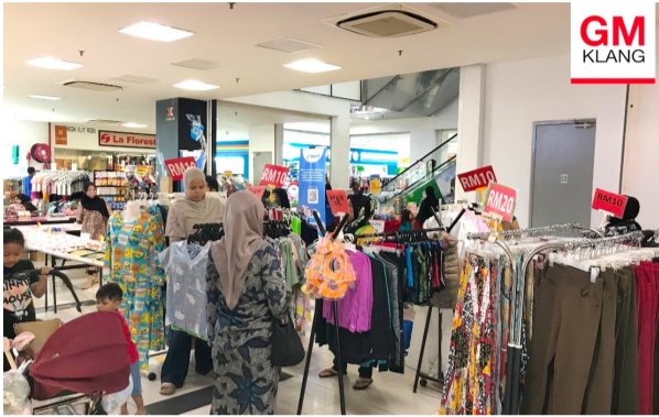
PPM, GM Klang hold stock clearance promotion