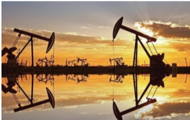
Oil prices advance despite massive build in US inventories