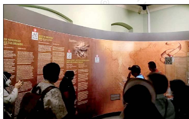
Visitors at the Sultan Abdul Aziz Royal Gallery.

The theme park's signature attraction is the City of Digital Lights, where over a million of environment-friendly LED lights transform the park into a colourful wonderland in the evenings.