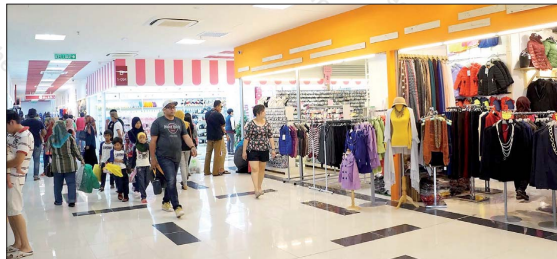
Inside GM Klang.

Complementing tourism destinations GM Klang stands as one of Selangor's favourite tourism products and has even been appointed as the official tourism