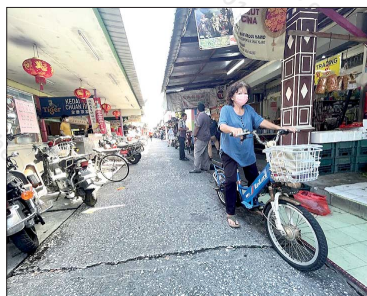
Bicycle and electric motorbike in a main street of Pulau Ketam, with shops and restaurants on both sides.