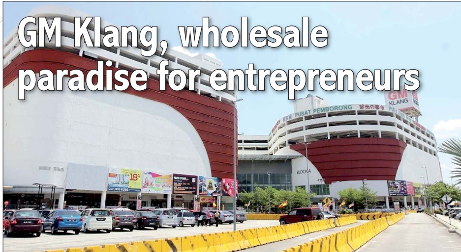
GM Klang buildings.